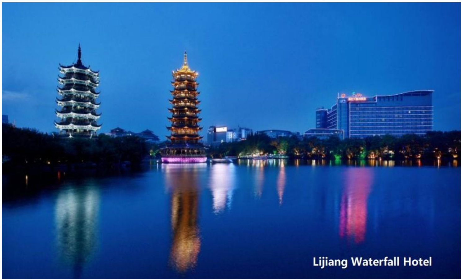
Lijiang Waterfall Hotel

Sunbow Tours can send a guide going to Guangzhou South with the guests. Just USD270 added.