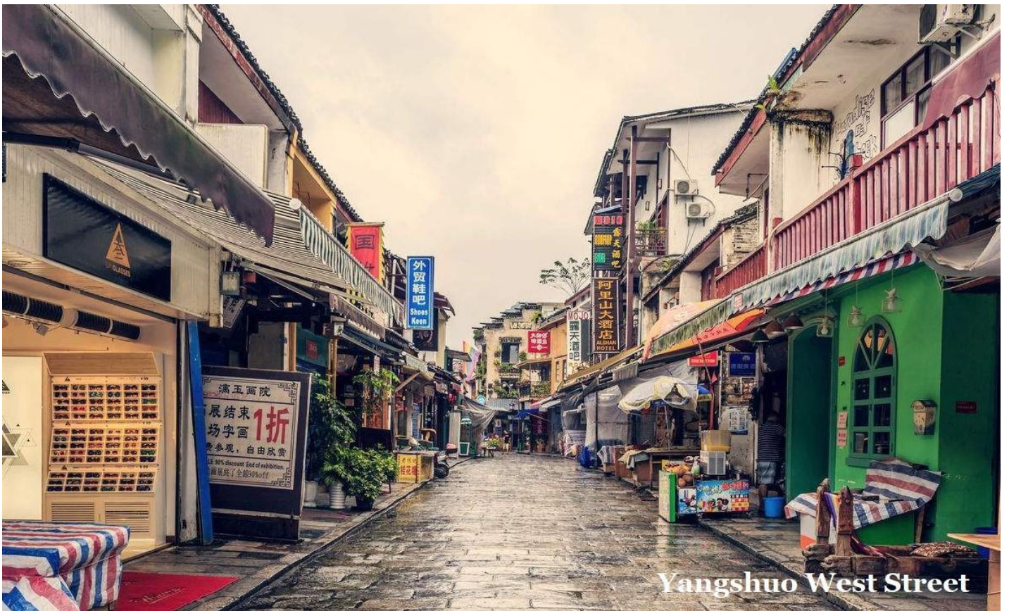
Yangshuo West Street