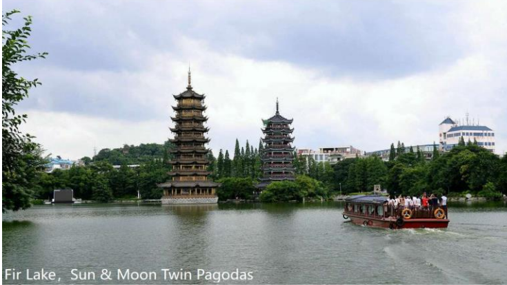
Fir Lake, Sun & Moon Twin Pagodas