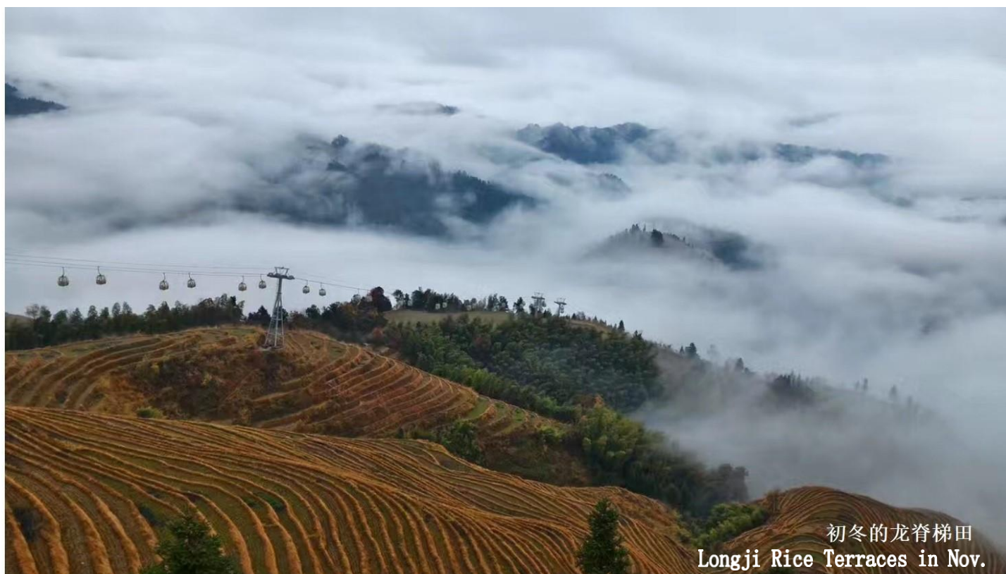
初冬的龙脊梯田 Longji Rice Terraces in Nov.