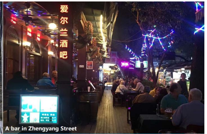
A bar in Zhengyang Street