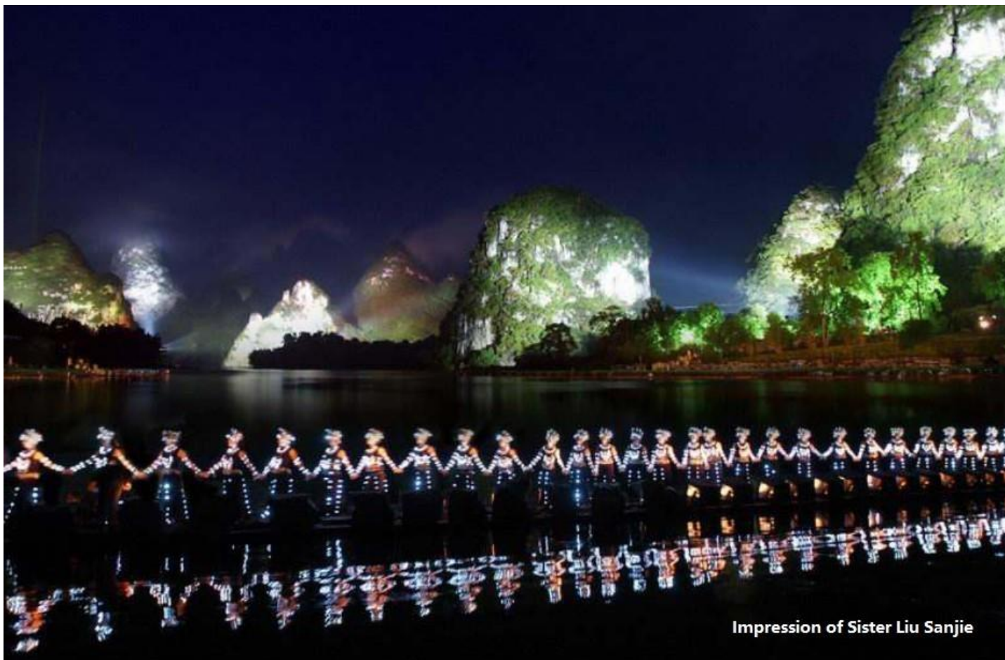
Impression of Sister Liu Sanjie