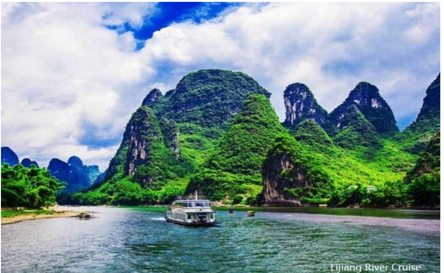
Lijiang River Cruise