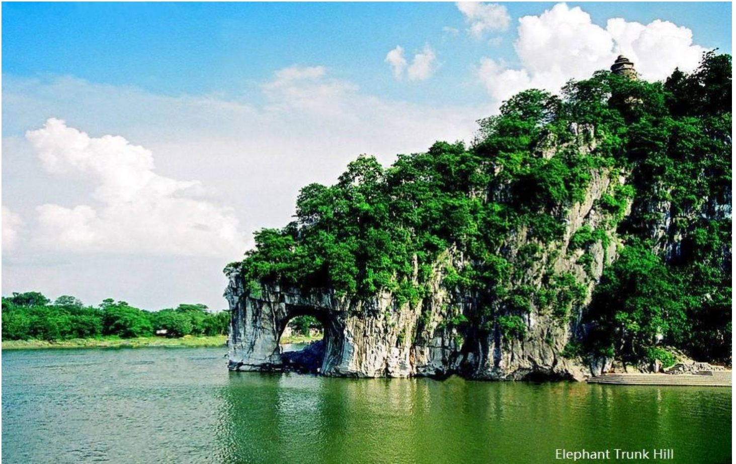
Elephant Trunk Hill