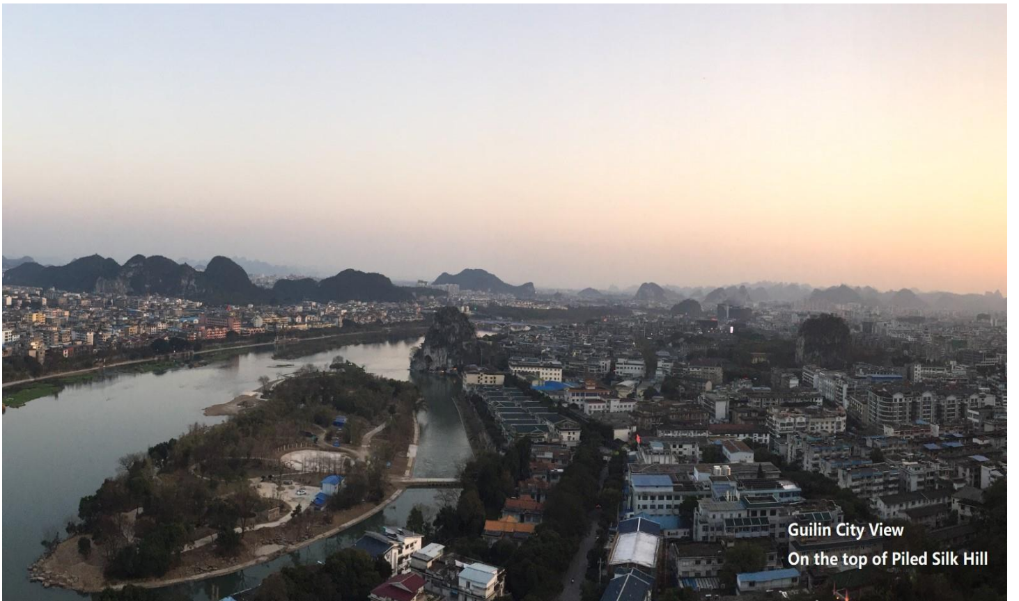
Guilin City View On the top of Piled Silk Hill