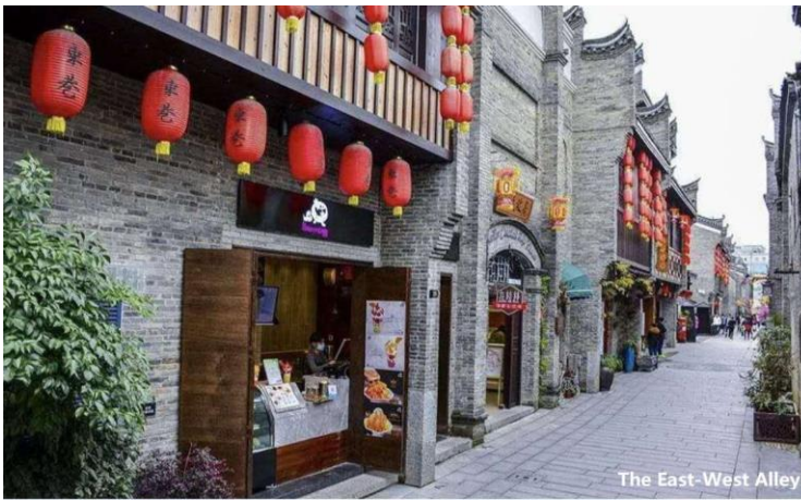
The East-West Alley